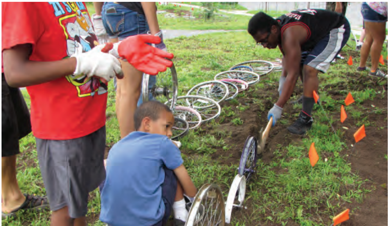
Planting cherry tomatoes for a grab-and-go ground-cover under our food forest fruit trees. Damaged bike wheels are saved from the waste stream, providing attractive protection for our young seedlings.