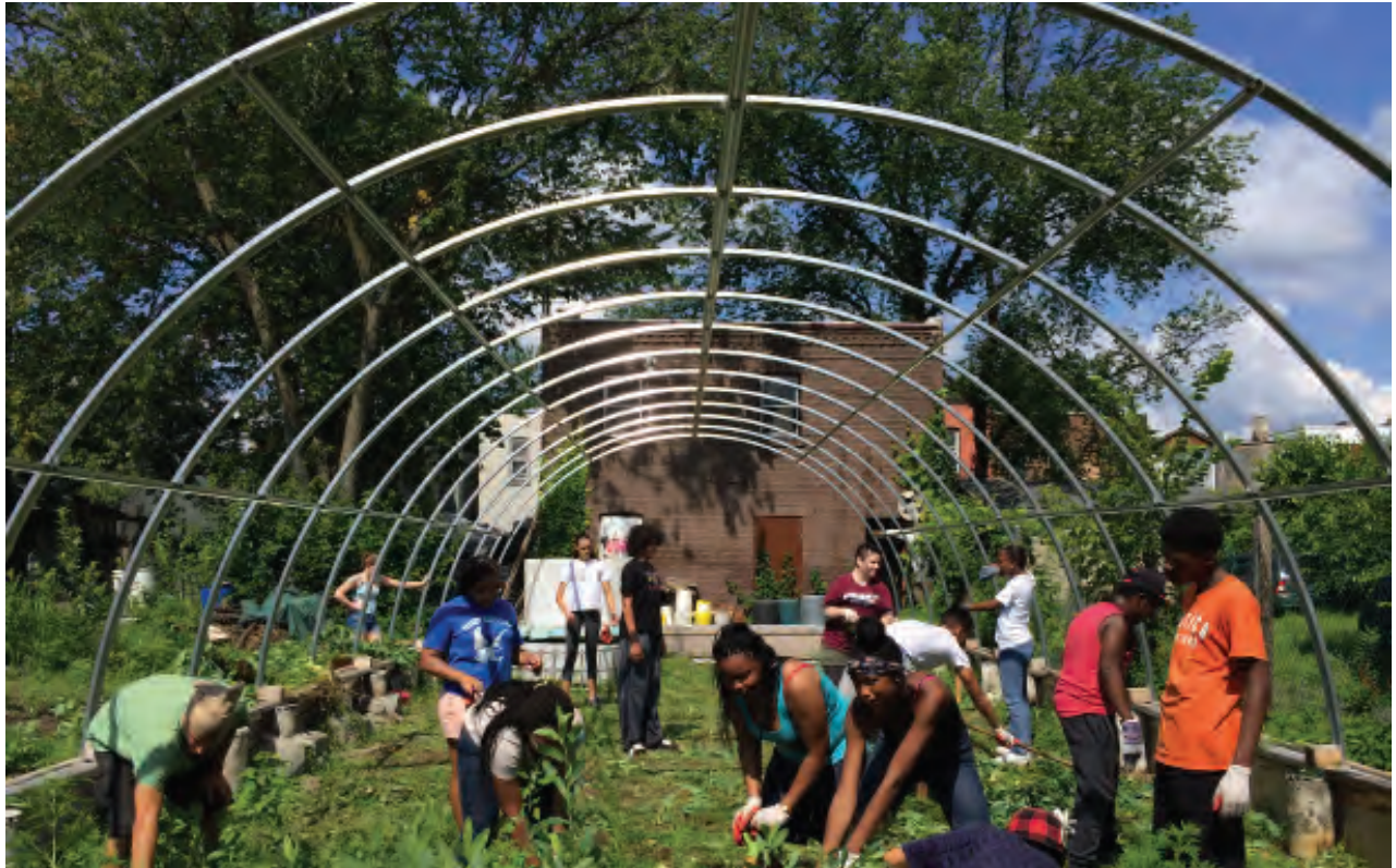
Weeding the ground under our hoop house, now covered and home to our experimental aquaponics project as well as the winter home for our chickens.