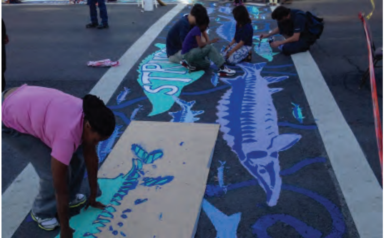
Collaborative street art showing the story of sturgeon in the Hudson River Estuary. First giant and plentiful, then smaller and fewer, with a recent trend toward revival.