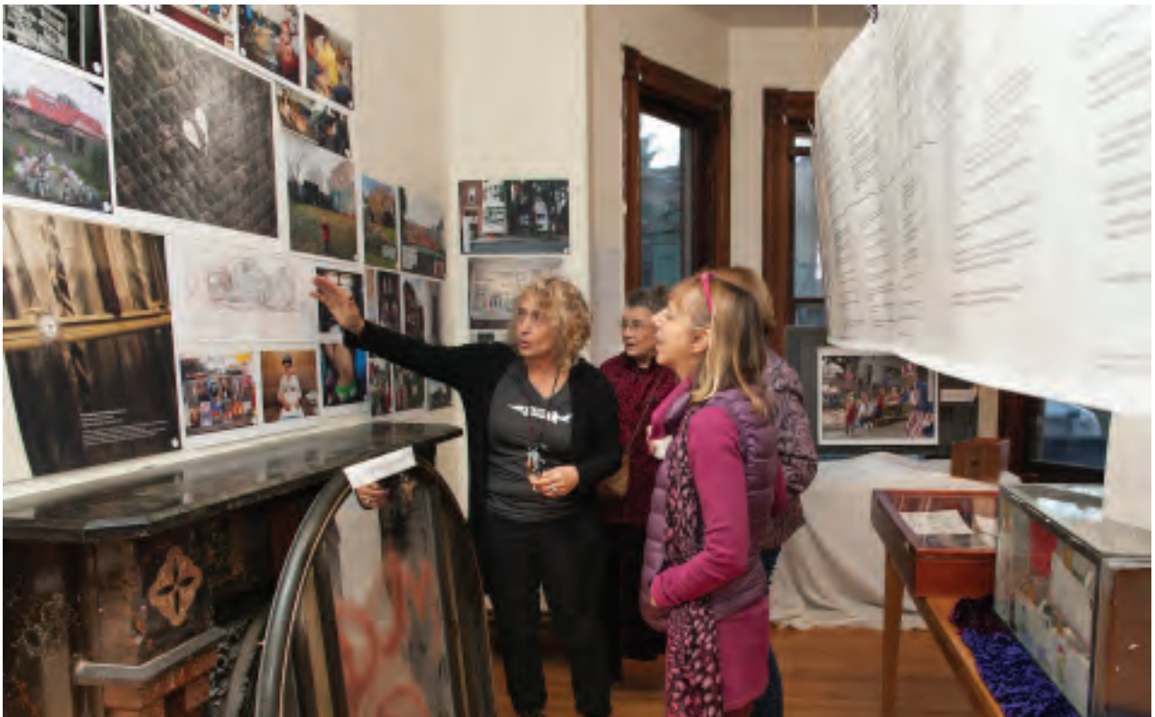
In 2017 the NATURE Lab Gallery exhibited the North Troy People's History Museum. This picture was featured in TIME Magazine.

http://time.com/4565429/brenda-ann-kenneally-north-troy/