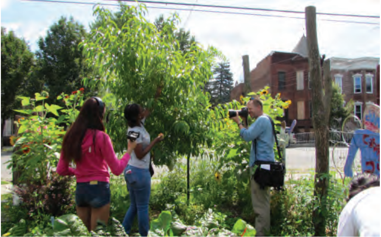
Picking peaches and documenting the harvest!